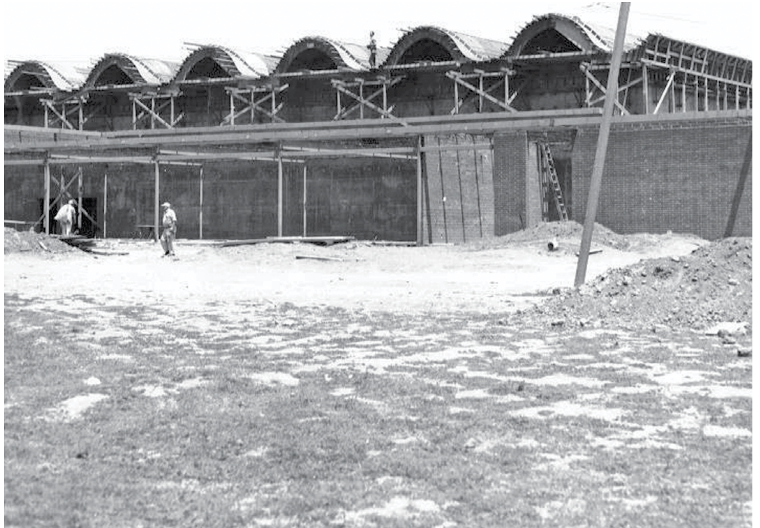
The unique characteristics of today's Hawthorne Memorial Center are seen here during the building's construction in the 1960s at 3901 W. El Segundo Blvd., just east of Prairie Avenue.